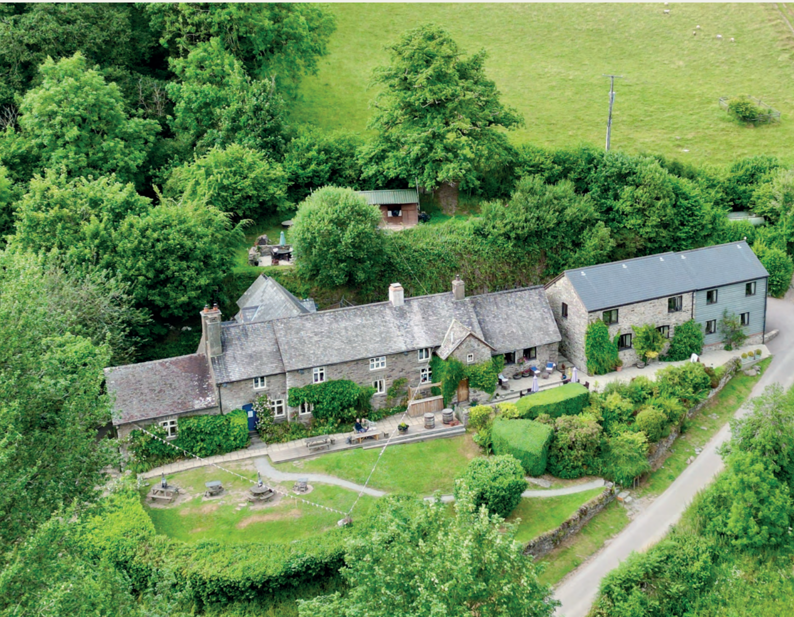
Tarr Farm 2023